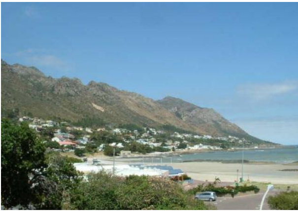
Sea view from balcony