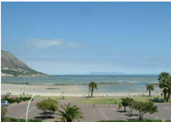
Sea view from balcony

All electricity, water and other service charges are included. Cleaning of the apartment during stays is available at extra cost.